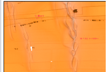
Presumed Glacial Features